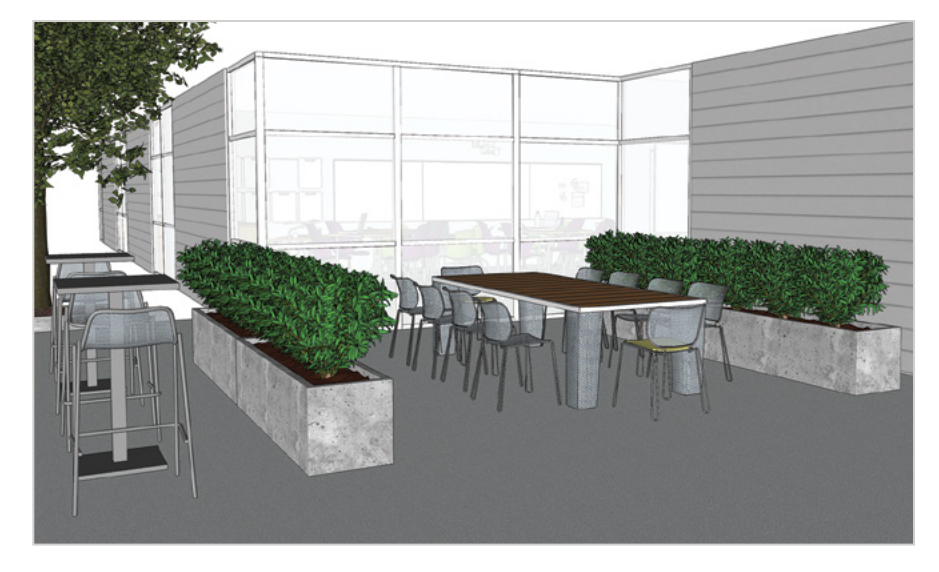
Planters define and shield settings, helping manage distractions.