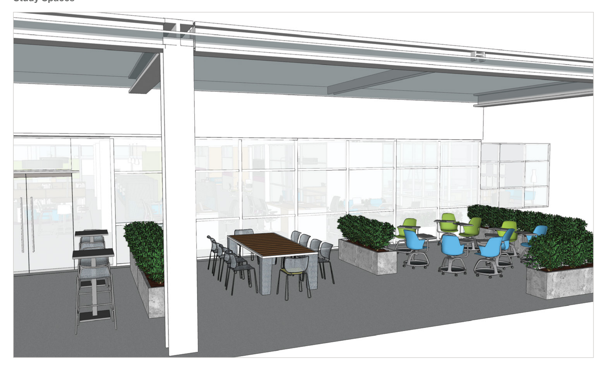
Overhangs provide protection from the elements in mild climates, allowing learning to extend outdoors.