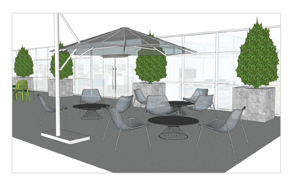
Umbrellas reduce glare on people and their devices so effective technology-enabled and person-to-person learning can occur.