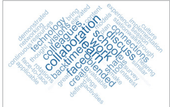
Word Cloud: Feedback about Most Valuable Aspect of the LBDL Program

Rhode Island LBDL participants and their partners confirmed the goal to continue to grow and expand the program. Reunion meeting conversation turned to strategies to share the learning at the upcoming RIASP summer conference. Principals also brainstormed possibilities for going deeper within each school and building and to offer more trainings to other schools and districts across Rhode Island. The celebration of Rhode Island blended and digital learning, capacity-building, professional learning and collaboration developed over the past year solidified the school leaders’ commitment to grow and deepen personalized learning models across Rhode Island.