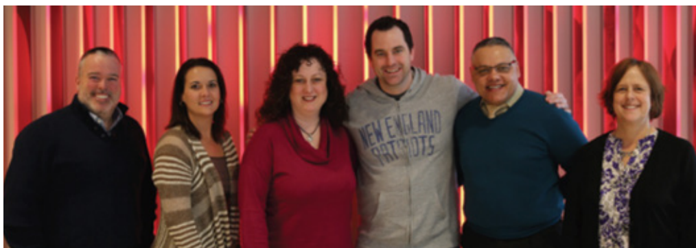
RIASP Facilitation Team at Friday Institute Facilitator Training

Leadership in Blended and Digital Learning (LBDL) is a unique, blended professional learning program, designed specifically to support school leaders in the transition to blended and digital learning. The Rhode Island Association of School Principals (RIASP) was one of six organizations selected to participate in the initial national LBDL pilot. A team of five Rhode Island school leaders were selected by RIASP to be trained by the Friday Institute to facilitate the LBDL program for Rhode Island principals, assistant principals and other school leaders.